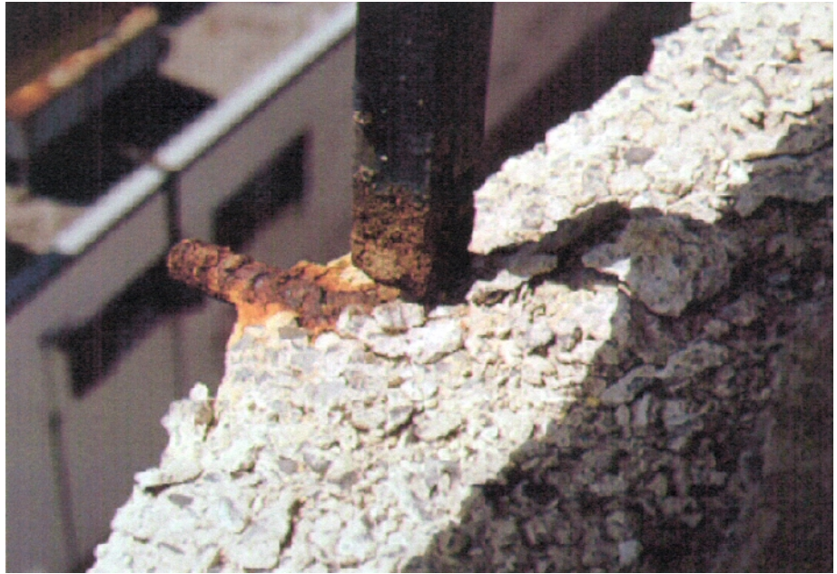
Railing post/slab anchor - note baseplate has completely deteriorated

Because more than half the balconies required major through-slab repairs,