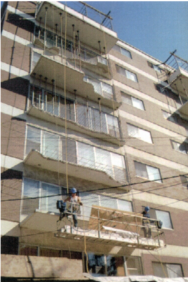
Deteriorated concrete removal in progress

membrane over the new, exposed concrete slabs. The polyurethane membrane is waterproof and applied in liquid form. It is designed for heavy use.