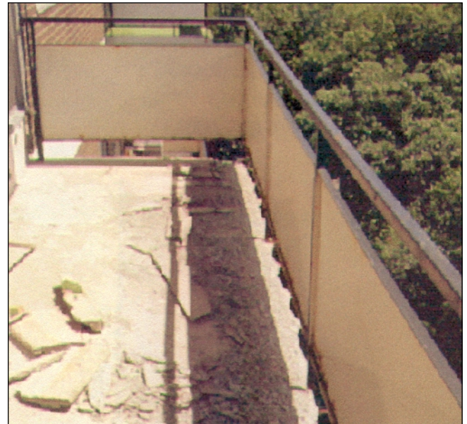
Example of extensive spalling

The condition survey showed extensive deterioration of the balcony slabs and balcony railings, with the most severe concrete delamination and spalling at the balcony edges. The concrete deterioration was the result of long-term freeze-thaw action caused by moisture penetration into the slab and corrosion of the balcony slab reinforcement. Inadequate concrete cover accelerated the moisture penetration and corrosion.