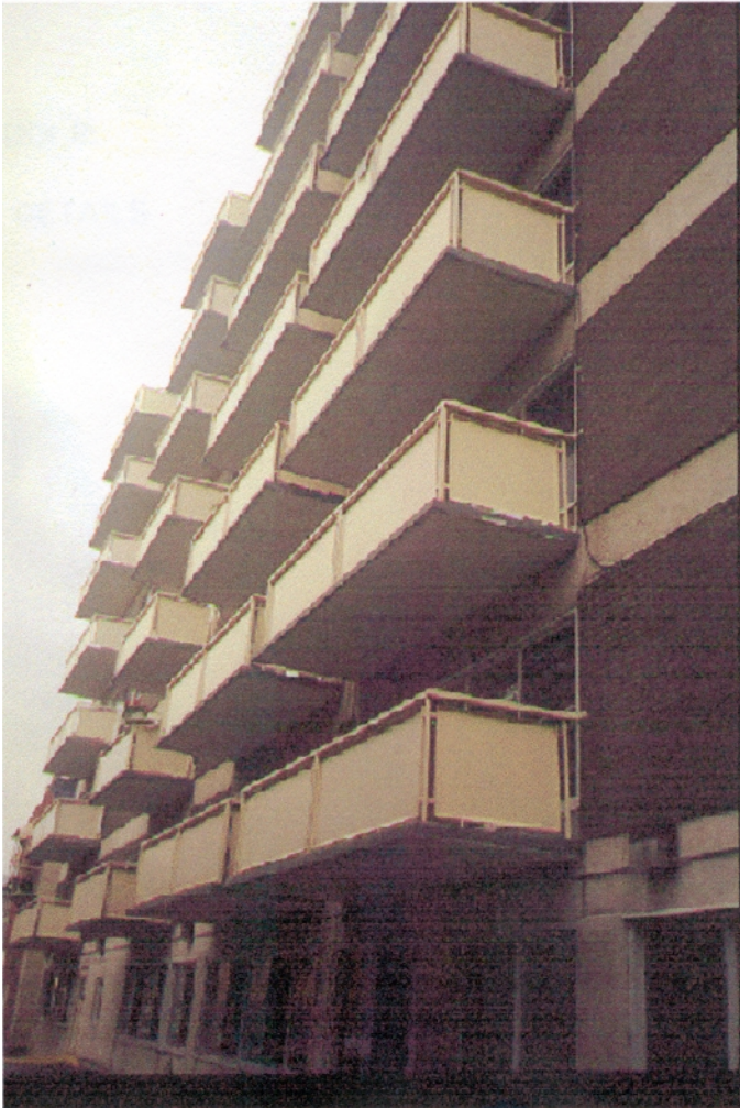
Repaired balcony slabs and railings